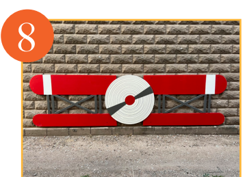
THE RED BARON