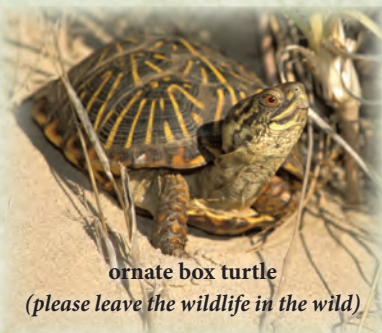
ornate box turtle (please leave the wildlife in the wild)

When finished, this hiking, biking and equestrian trail will stretch 321 miles across Nebraska. The trail will pass over 221 bridges and through 29 communities nicely spaced about 10 to 15 miles apart. These communities