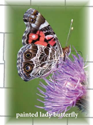
painted lady butterfly